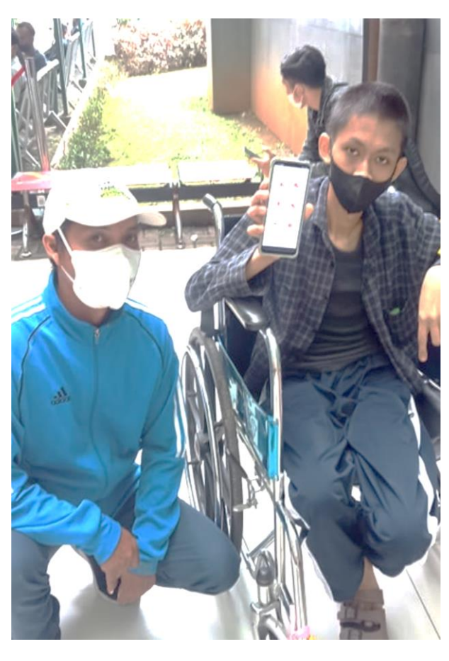
A still of community representative counselling a person affected by TB through LaporTBC powered by OneImpact

During the period January-May 2024, POP TB Indonesia worked closely with TB program implementers (health offices, SR/SSR, survivor organizations, CSOs) in each intervention area to expand the socialization/ promotion of LaporTBC powered by OneImpact. A total of 26 collaboration forums were organized with over 1,152 participants. Through this collaboration model the idea is to increase the utilization of CLM data in Indonesia.